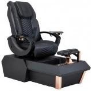
FOSHAN DOSHOWER SANITARY WARE CO., LTD.