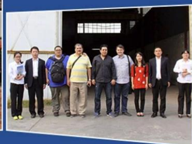
Our group photo with the customer