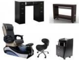
FOSHAN DOSHOWER SANITARY WARE CO., LTD.