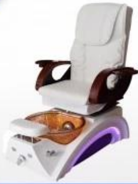
FOSHAN DOSHOWER SANITARY WARE CO., LTD.