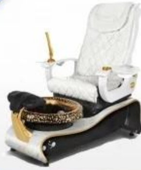
FOSHAN DOSHOWER SANITARY WARE CO., LTD.