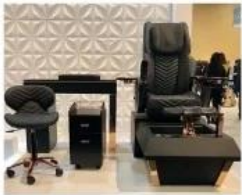
FOSHAN DOSHOWER SANITARY WARE CO., LTD.