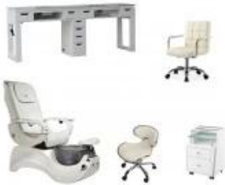
FOSHAN DOSHOWER SANITARY WARE CO., LTD.