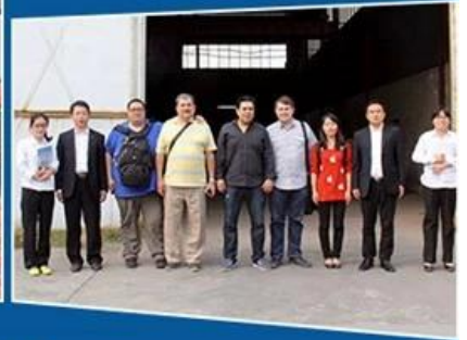
Our group photo with the customer