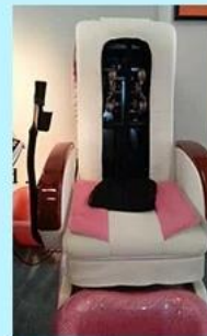
Human touch massage