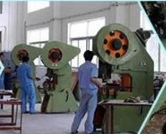
3. Production machinery