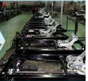
4. The prototype