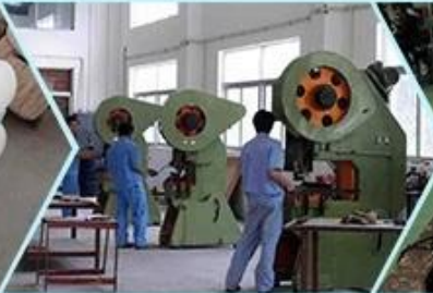
3. Production machinery