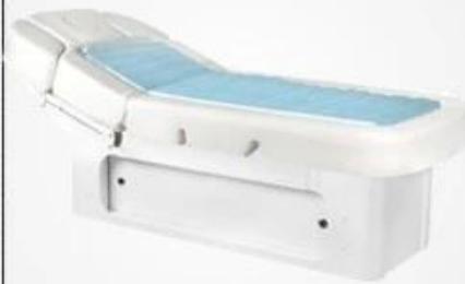
Massage Bed & Massage Table