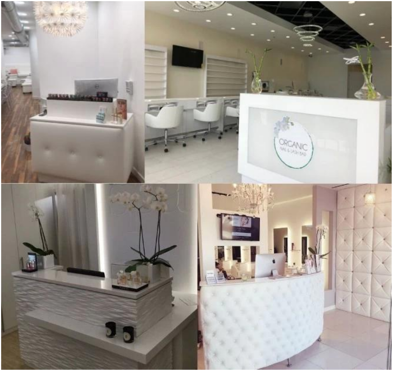
HOT SALE SALON FURNITURE