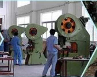
3. Production machinery