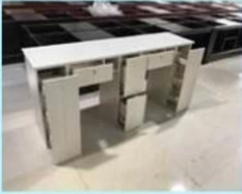
Step1: Test product before packing.