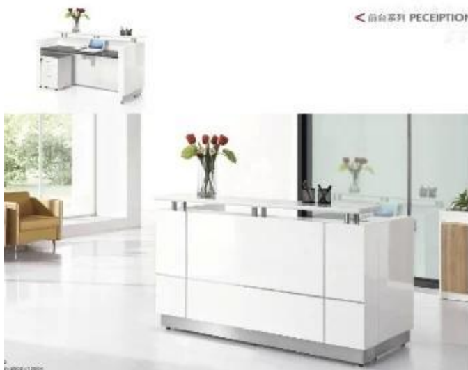
← 前台系列 PECEPTION