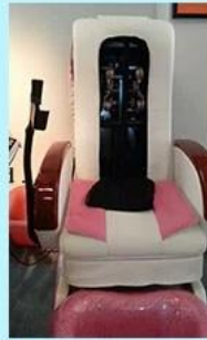
Human touch massage