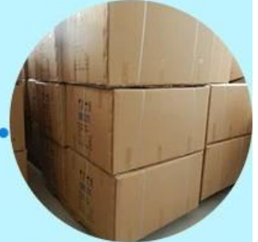
Step3: Ready to ship out.