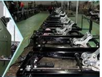
4. The prototype