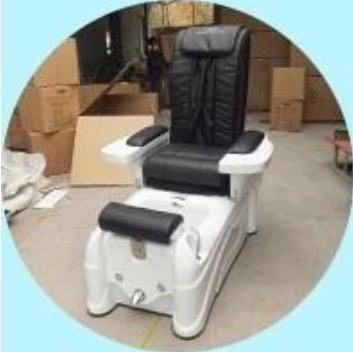
Step1: Test product before packing.