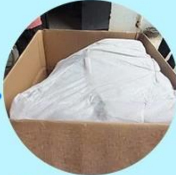
Step2: Wrapping with polly and padding.