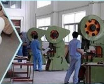
3. Production machinery