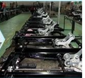
4. The prototype