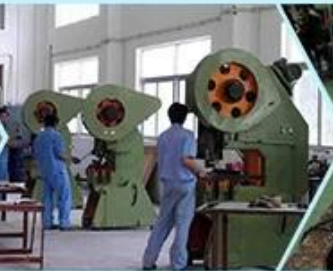
3. Production machinery