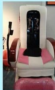
Human touch massage