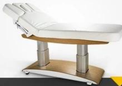
Massage Bed & Massage Table