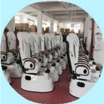
Step1: Test product before packing.