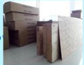
Step3: Ready to ship out.