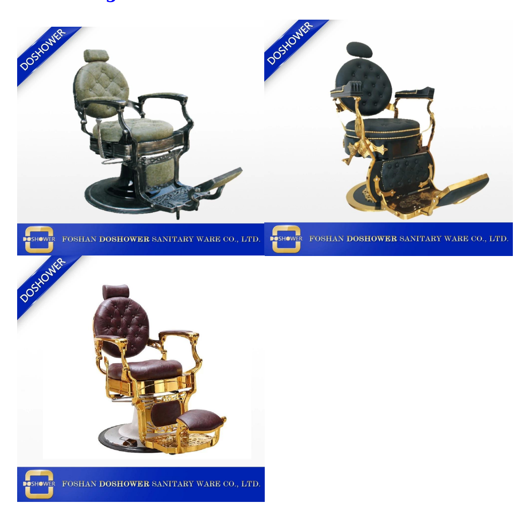
Hot Sale Package