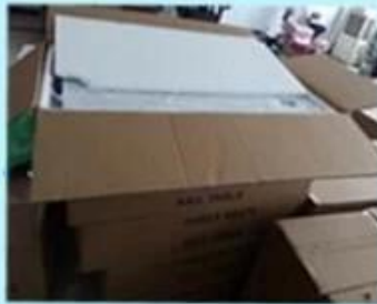
Step2: Wrapping with polly and padding.