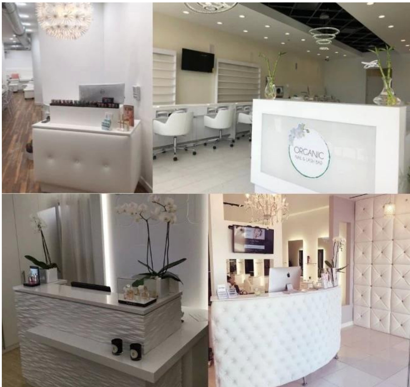
HOT SALE SALON FURNITURE