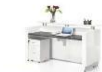
← 前台系列 PECEPTION