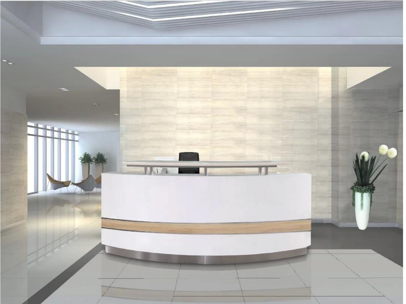
Other Salon Furniture marble nail table with manicure chair station