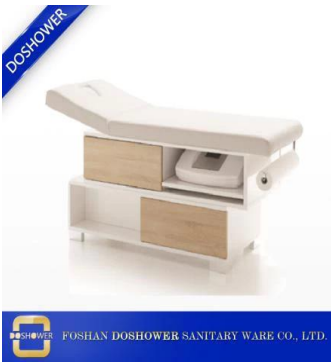
WOOD MASSAGE BED