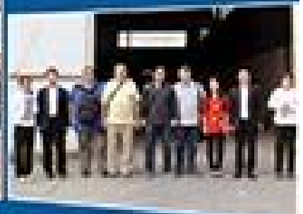
Our group photo with the customer