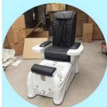
Step1: Test product before packing.