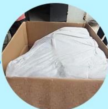
Step2: Wrapping with polly and padding.