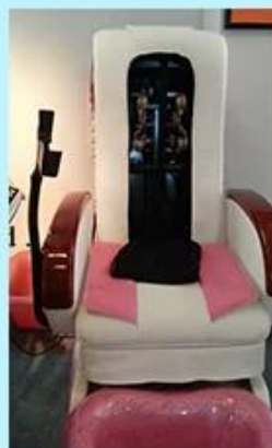
Human touch massage