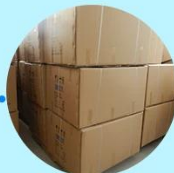
Step3: Ready to ship out.