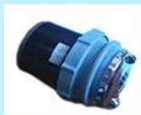
Magnet jet (Optional)