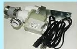
Discharge pump (Optional)