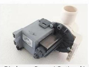
Discharge Pump (Optional)

· Kneading, knocking, flapping, rolling with 6