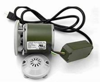
Magnet Jet (Optional)