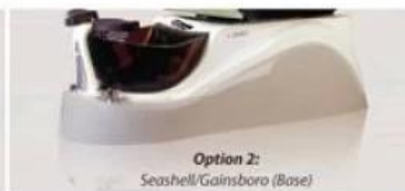
Seashell/ Gainsboro ( Base )