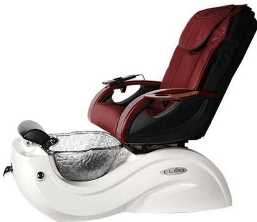
Chair: Red Base: White Bowl: Crystal Reflections