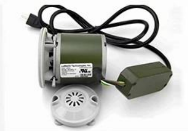
Magnet Jet ( Optional )