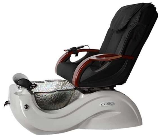
Chair: Black Base: Grey Bowl: Black Nickel