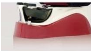
Seashell/ Red ( Base )