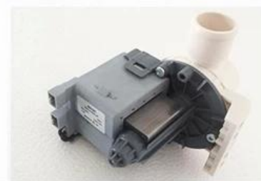
Discharge Pump ( Optional )