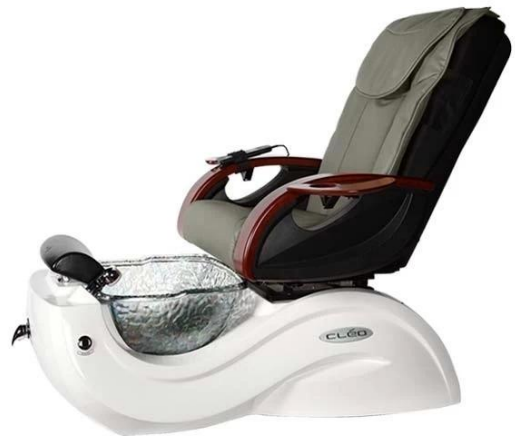
Chair: Green Base: White Bowl: Black Nickel