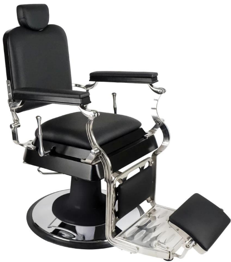
Masssssage Bed&Nail Table