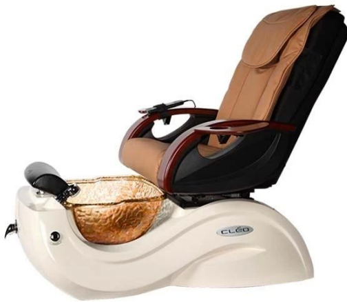
Chair: Mocha Base: Bone Bowl: Champagne Gold

Any color chair top can be matched with any base and bowl color