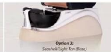
Seashell/ Light Tan ( Base )