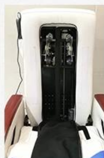
Human Touch Massage