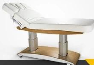
Massage Bed & Massage Table