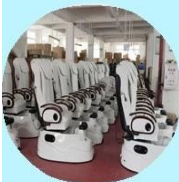
Step1:Test product before packing.