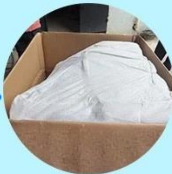
Step2: Wrapping with polly and padding.