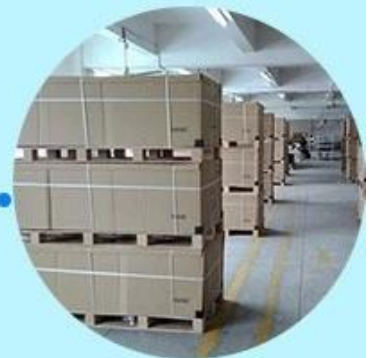
Step3:Ready to ship out.