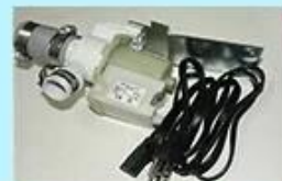
Discharge pump (Optional)