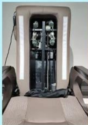
Human touch massage